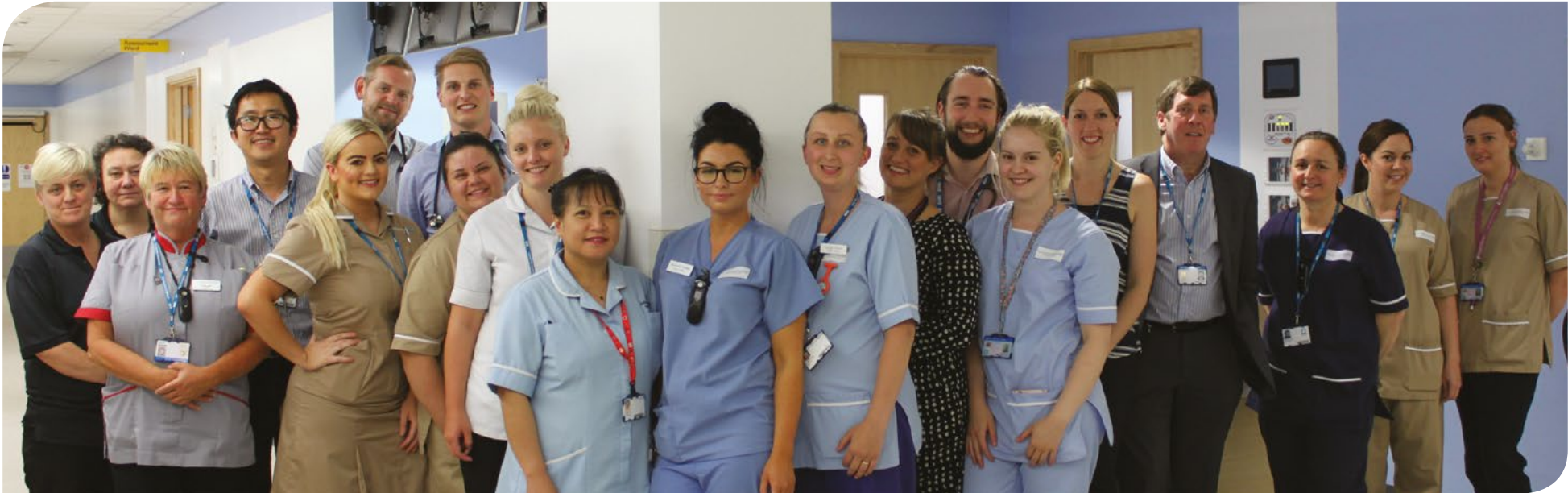
Staff in the new Integrated Assessment Unit at Sunderland Royal Hospital